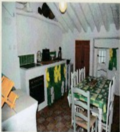
Top floor kitchen

For further information please telephone Graham Hunter Phone: 01761 435204 Mobile: 07787 106833