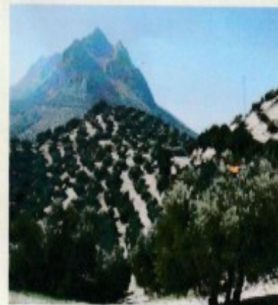
Nearby olive groves