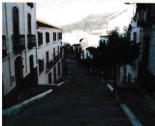
Steps down from the castle

CARCABUEY is a small town in the Cordoba province of Andalucia, situated in the Natural Park of the Sierras Subbeticas. It is a typical Spanish town of Moorish origin with several interesting churches and the ruins of a castle. There are 3 restaurants and many bars and small shops to choose from. The splendid cultural cities of Cordoba and Granada are approximately one hour away and Seville 2 hours. The nearest large town is Priego de Cordoba 6 km away-it is interesting to visit and has a large supermarket. During the year in Carcabuey several festivals are celebrated including Corpus Christi and Holy Week.