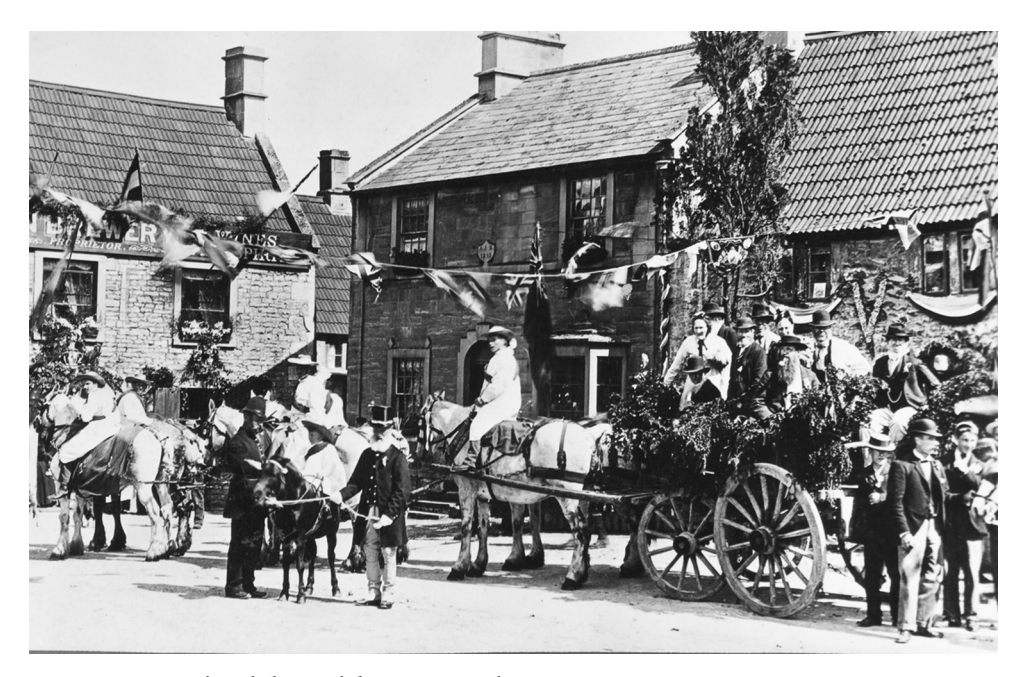
Queen Victoria's Jubilee Celebrations in the Square in 1887