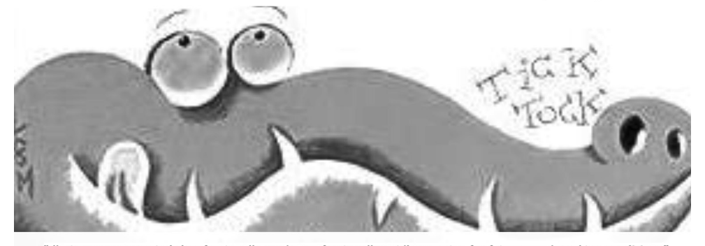
"Illyria supports Equity's 'Professionally Made, Professionally Paid' campaign for fair pay and working conditions" "Peter Pan" is presented by arrangement with Great Ormond Street Hospital Children's Charity and Concord Theatricals Ltd. on behalf of Samuel French Ltd. www.concordtheatricals.co.uk

Gate opens: 5:00pm - Show starts: 6:00pm Bring chairs or a rug, arrive at 5pm & have a picnic Tickets: illyria.co.uk & at Wellow Parlour Shop Adults £14 - Children £7.00 (4-16)