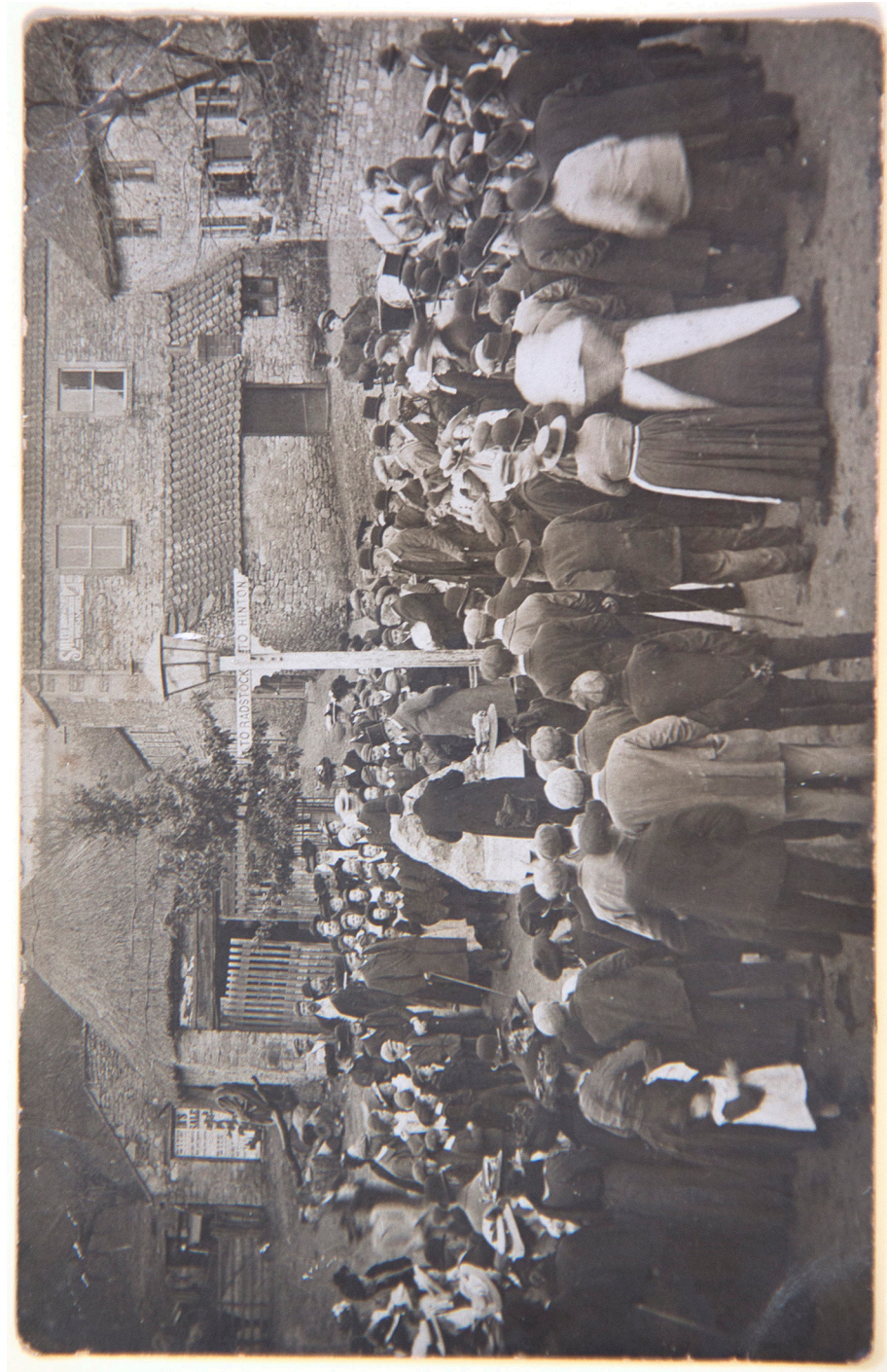
Dedication of the horse trough on the Batch which is a memorial to the Wellow Guardian of the Poor between 1875 and 1905.